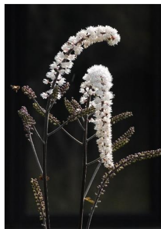
Cimicifuga racemosa

This month the newsletter continues the exploration of native plant gardens with our native plant tours. We also explore a wetlands restoration project and learn more about mason bees and pollinator victory gardens. Perhaps most exciting of all, we announce the winners of the 2020 Spotlight on Natives Photo Contest. Thank you to the many photographers who presented a wonderful array of native plants. Their stunning photos embody their affection for these beautiful plants and are truly inspirational. MPS