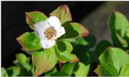
Bunchberry Cornus canadensis