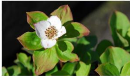
Bunchberry Cornus canadensis

Enjoy all the ELA Membership Benefits - including free and discounted events. Become a Member!