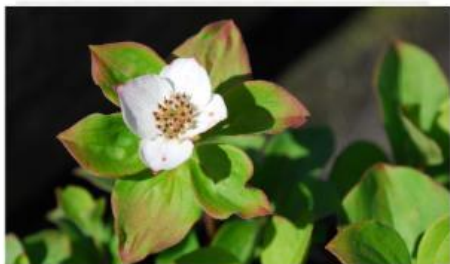
Bunchberry Cornus canadensis