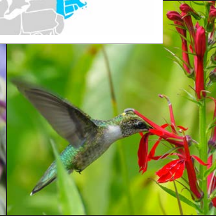
Wrinkleleaf goldenrod, spiderwort, and cardinal flower.

The Northeast Region encompasses southern Quebec, New Brunswick, Nova Scotia, the New England states, and eastern New York. High regional variation in topography, soils, and climate translates to tremendous ecological diversity, ranging from the coastal dunes and tidal ecosystems along the Atlantic shoreline, to the spectacularly species-rich deciduous forests and riparian communities of the Appalachian Highlands.