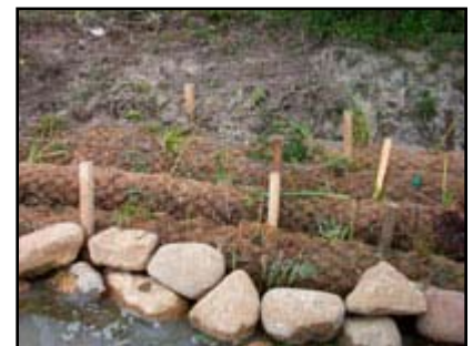
Biologs installed.

tion-based JF New ecological services company. Three innovative products employed in these efforts are biologs, live stakes, and floating islands. Biologs and live stakes are used as part of a riparian anchoring system. These devices will accommodate various slope ratings, channel speeds and biodegradation requirements. The ecological beauty of these products is their ability to become part of the solution. Biologs are made of coconut fiber, filled with soil, and planted with native species that are appropriate to the site and of local origin. The biologs are then held in place with live stakes. These live stakes, usually Cornus, Salix or Sambucus, are harvested when dormant and stored under climatic control. When installed to support biologs these live stakes will begin to sprout. The stakes send out roots, aiding in erosion control, and vegetative growth to support the diversity of