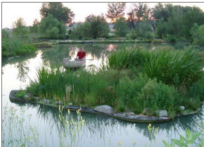
Floating Island at work.

Floating islands work by enhancing a naturally-occurring symbiotic relationship. This relationship involves