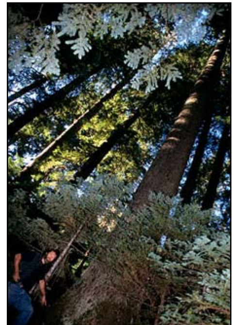
Bridgeoporus (Oxyporus) nobilissimus, the first mushroom declared endangered, grows on this noble fir.

Belonging now to the super-kingdom Ophisthokonta, fungi are classed with animals. Such reclassification understands such realities as the fact that antibiotics produced by fungi are commonly equally effective for use by humans. In fact, fungi seem able to empower life and growth for every creature under diverse stressors through their incessant gift of water, nutrients, and anti-pathogenic compounds to plants and animals. This much was known to ancient Otzi, the Ice Man discovered in the Otztal Alps, who carried among his treasured necessities both fungi and lichens having many known uses both mundane and medicinal today, and likely in Otzi’s time as well. Stamets speaks of the medicinal forest and the vast potential for fungi to heal. Fungi have been tested with effectiveness against everything from smallpox to Serin gas; such is their ability to neutralize pathogens and toxins.