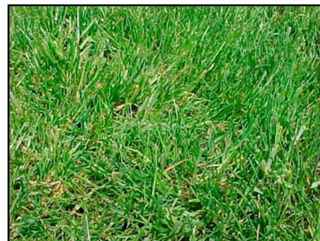
Festuca rubra lawn.

For turf style grasses in a shady environment turn to the sedges. Catlin sedge, Carex texensis , is a fine, short sedge well-suited for partial to full shade. Even though considered to be tolerant of sun, you might find that too much sun will lead to faded foliage and the need for more water. Hardy from zone 6 down to zone 10, this is an excellent choice for hot climates of the south. For the same success in cooler locations, turn to Pennsylvania sedge, Carex pensylvanica . Also a