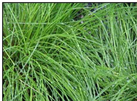
Carex pensylvanica , as fine as any grass.

remaining dense, low, and compact through the hot summer months. In both cases the only notable drawback was that the intense flowering of clover attracts bees to the lawn which can be a problem for bare feet. Yarrow, Achillea millefolium , was selected for its dark green foliage, rhizomatous habit, plus drought and wear tolerance. It quickly stole the show. Providing green while the grasses begin to go dormant, yarrow mowed every three weeks creates a dense, non-flowering texture that surprises even the most conservative lawn enthusiast. A third broadleaf of importance is English lawn daisy, Bellis perennis . Mixed alongside clover and yarrow, the English lawn daisy provides a strong flowering of white to red blossoms from March through May, even while mowing on a three-week cycle. Though the daisies slowly dwindle in population over four or