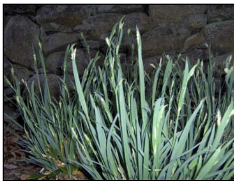
Carex platyphylla . Photo by James Cachat.

Always searching for new shade alternatives myself, here are two last clumping sedges to consider for shadier locations. Plantain-leaf sedge, Carex plantaginea , forms neat clumps in average soil. This species puts out eye-catching seed heads early and holds up well when summer's dryness takes hold. Mow this grass right after