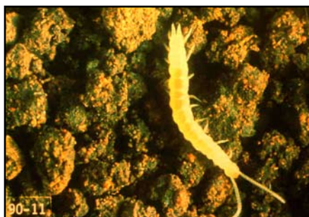
Garden Symphylan.

Dr. Ingham stated that alcohol damages any living cell membrane at 1 ppm. Anaerobic soil or compost