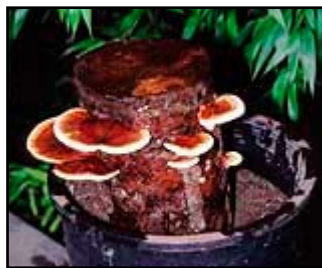
Reishi growing on potted alder log.

At times visionary and other times whimsical, Mycelium Running will overwhelm you with possibility, amaze you with complexity, and give you reason to find hope in a healthier future. This book and the ideas within its covers are a splendid interaction between pure geek science, pop culture, and the pressing need to provide a safe and viable home for ourselves. Fungi also point out a valuable lesson in perspective: for decades largely ignored and looked upon as pathogens, fungi are now better understood as a longstanding antimicrobial savior of the human species, and a paradigm for recovering vibrant ecosystems that we have damaged.