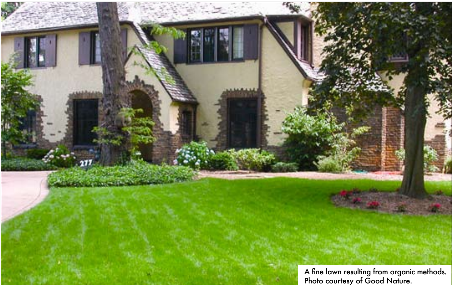
A fine lawn resulting from organic methods.

The educational and informational talks we give will typically cover topics such as: “What is Organic?” “Why Organic?” “How do I go Organic?” and “What products do I need to go organic?” There does seem to be some confusion about what is organic and many people automatically think of manure when they hear the word organic. We inform them that our main fertilizer is made from corn, soy and alfalfa. We next cover why organic is important and explain the water quality, environmental impacts, and possible risks to pets and humans of using lawn chemicals. Then we tell them one of the best reasons to go organic is that the plants and lawns love it! A lawn’s health and ability to fight diseases and insects is directly related to a healthy microbial population which is fed by the organics. But still people wonder do organics really work? We tell them yes – but it is a process and they probably won’t see results as fast as with a chemical program. Then there is the