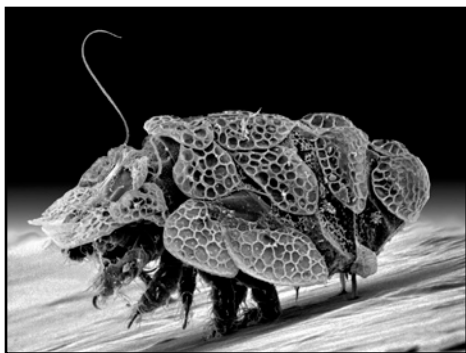
Oribatid mite.

cold temperature species are not active during warm weather and vice-versa. Soil life is diverse and metabolizes organic compounds under different soil moisture and temperature regimes so organic matter breakdown is a dynamic and natural process. When soil biology is unbalanced or incomplete, that is when nutrient cycling and recycling are insufficient for the natural fertility process to adequately support plant growth.